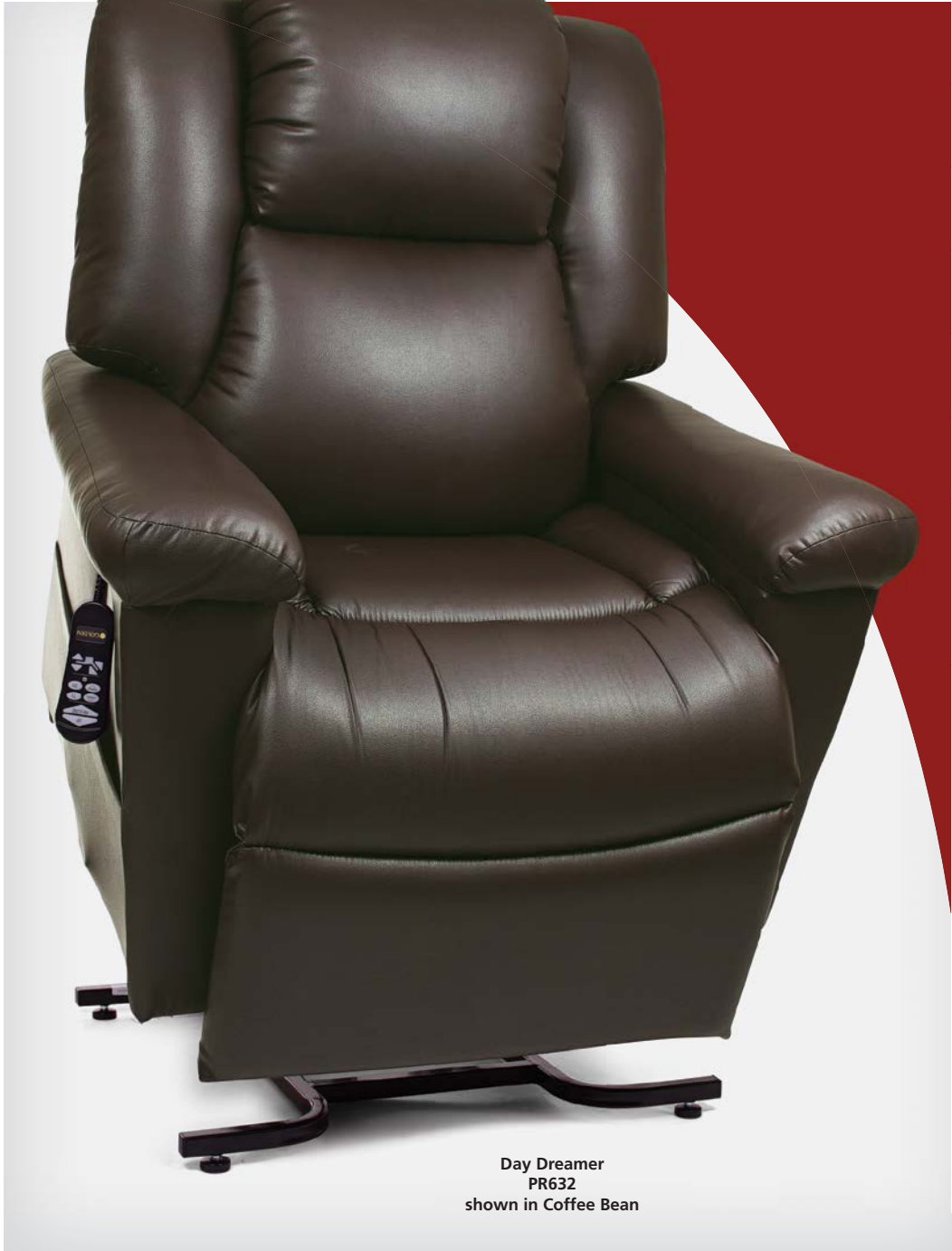
Day Dreamer PR632 shown in Coffee Bean