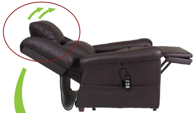
Power Articulation Head Forward

Sizes may vary depending on fabric, filling material, upholstery and carpet thickness. All measurements taken on concrete floor using levels and metal rulers.