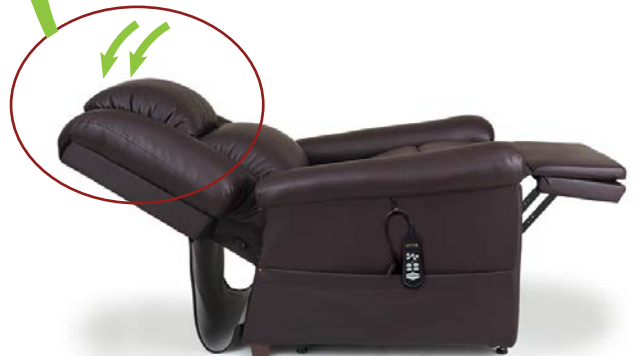
Power Articulation Head Back