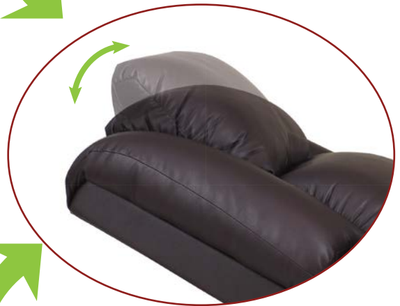
Power Articulation Head